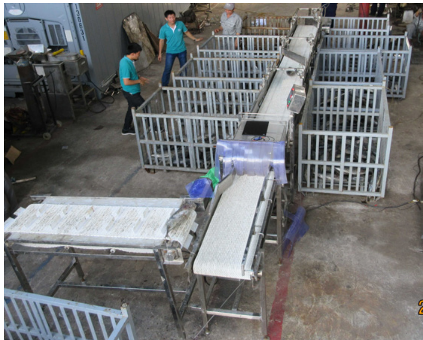
(Hình ảnh hệ thống cân trong thực tế)