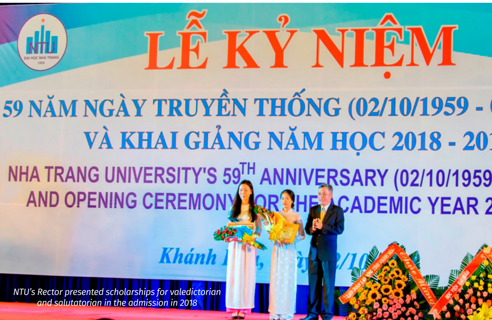
NTU's Rector presented scholarships for valedictorian and salutatorian in the admission in 2018

Nha Trang University (NTU) has been developing continuously over 59 years in terms of training, research, human resources and international cooperation in both quality and quantity. Moreover, in April, NTU was honored to receive the certificate of quality assurance for the second time (first time in 2009). This achievement is due to our staff's solidarity and effort.