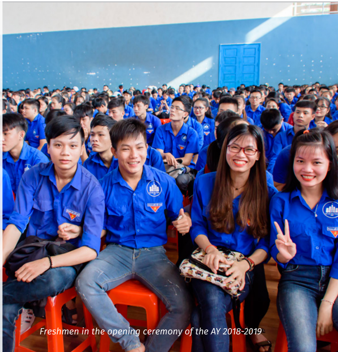
Freshmen in the opening ceremony of the AY 2018-2019

On October 2, 2018, all freshmen attended the 59 th Anniversary and Opening Ceremony of the AY 2018-2019. At the ceremony, the new students learnt about the University's history and achievements, expressed their aspirations as well as received scholarships from the university and other businesses.